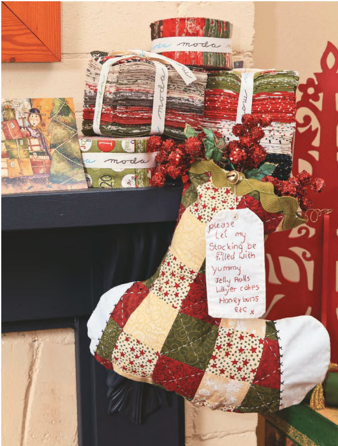
Moda festive fat quarter packs and jelly rolls courtesy of PK Fabrics.