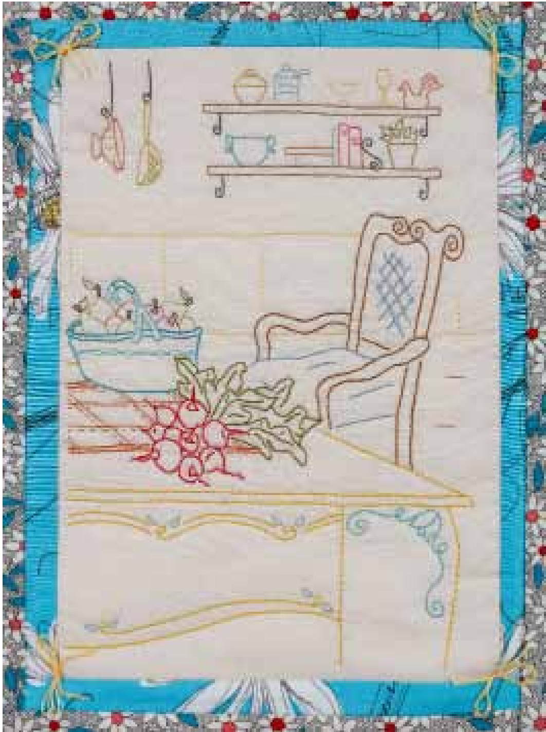
The fifth block in the Stitch-A-Long project is the Du Jardin design.