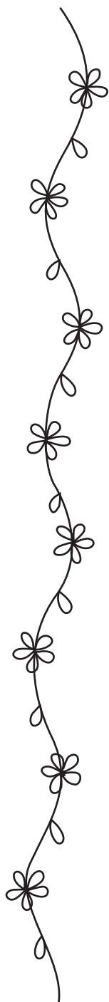
"PETITE AMOUR" Stitchery design for bag