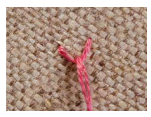
2^{\text{Pull}} the thread through to form the first L-shaped stitch. The two arms are typically about equal in length, but the stitch can be worked longer or shorter in either direction.

1 Working top to bottom, bring the needle up and keeping the thread under the needle, insert it one stitch width down and to the left. Come up again on the line.