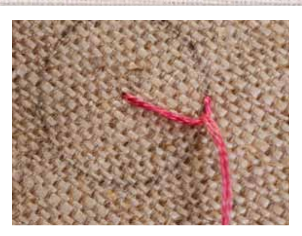
Pull the thread through to form the first stitch – this time the L is quite elongated.