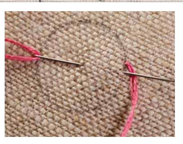
7 For a blanket-stitch pinwheel, bring the needle up at the edge of the circle and insert it in the centre. Keeping the thread under the needle, come up again on the circle.