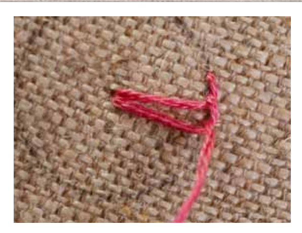
1 O <sup>Pull</sup> the thread through to complete the second stitch. Each stitch should go down in the same hole at the centre.