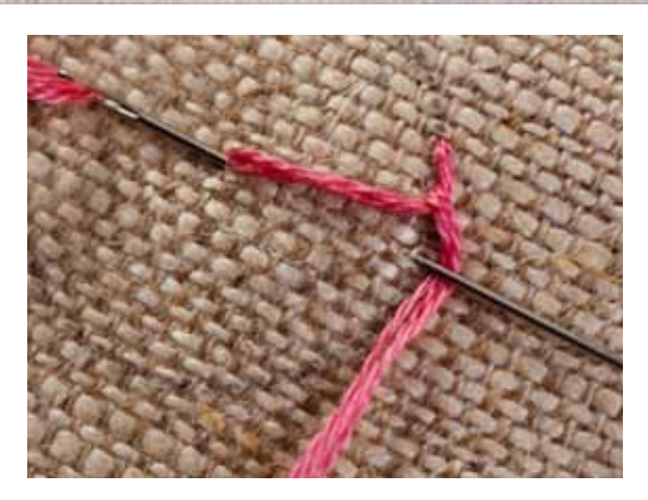
9 Repeat Step 7 to form the second stitch. Decide at the start whether to work the stitches so close together that the circle appears solid, or spaced closely or far apart.