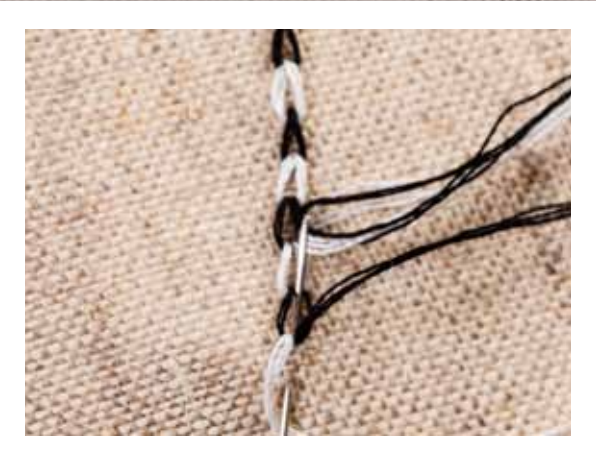
Ocontinue working chain stitches along the design line using each thread alternately.

O The third stitch is completed and the white thread is in position to begin the fourth chain stitch.