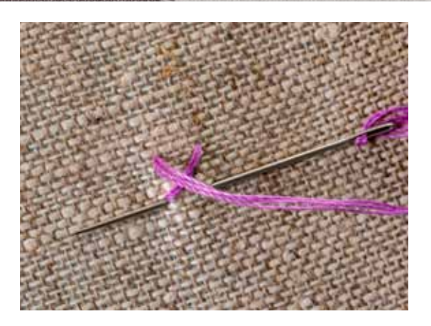
2 Pull the thread through to form a half-cross stitch. Then insert the needle at the bottom right corner to make a cross stitch and bring it up at the bottom left starting point.