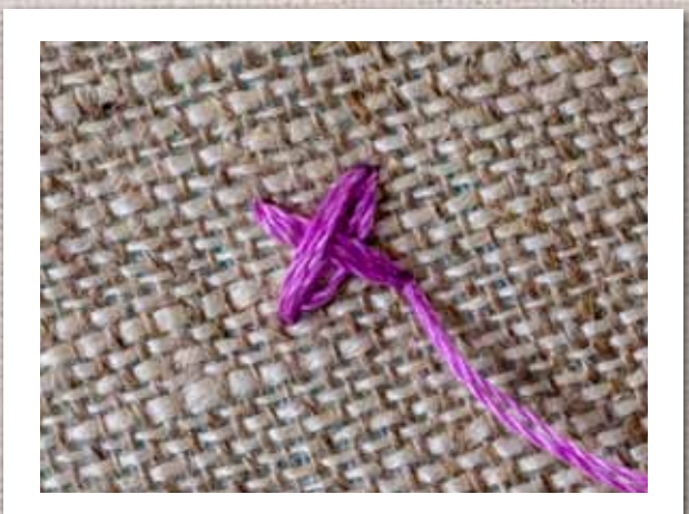
5 Pull the thread through. Encourage the upper stitch to curve slightly upwards but with both stitches going through the same holes in the fabric.