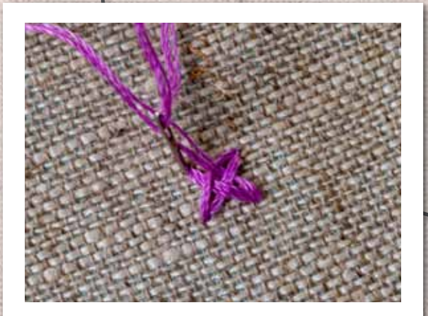
Insert the needle at the top left in the same hole as the previous stitch. The stitch can be worked on evenweave fabric or more informally on other fabrics.