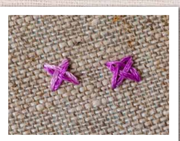
10^{\rm Choose} a toning colour and bring it up at the bottom left of the single cross stitch. Repeat Steps 4-8 to complete the two-colour woven cross stitch.