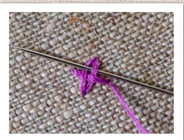
6 This is the weaving step. Insert the needle under the bottom stitch and over the upper stitch as shown, without piercing the fabric. A tapestry needle is best to use.