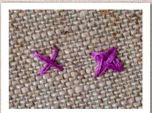
9 For a two-coloured variation, form the initial cross stitch as described in Steps 1-3, but don't bring the needle up at the lower left this time.