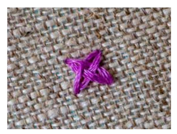
Pull the thread through to complete one woven cross stitch. The weaving process encourages the arms of the stitch to curve slightly. Don't pull the thread too tightly.