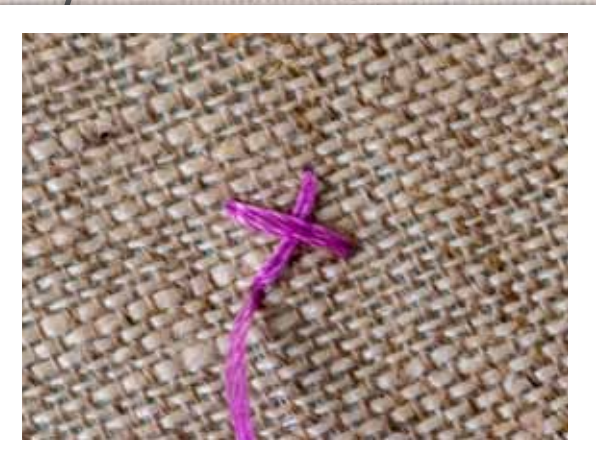
3 Pull the thread through. You should have a standard cross stitch with the thread emerging from the original starting point. Three strands of thread are being used here.