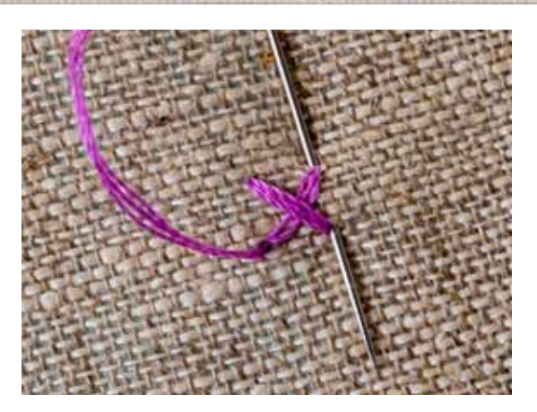
Insert the needle at the top right again, crossing over the previous half of the stitch and emerging bottom right. Nudge the first half-cross stitch to curve downwards slightly.