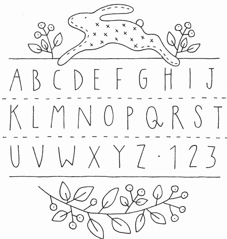
“OWL & HARE HOLLOW” Hare Sampler stitchery design

Print your chosen design/templates from the Homespun website. Before printing, check the Print dialog box – it is important that in the field next to the words “Page Scaling” you have selected “None” to ensure your design/templates print out at 100%.