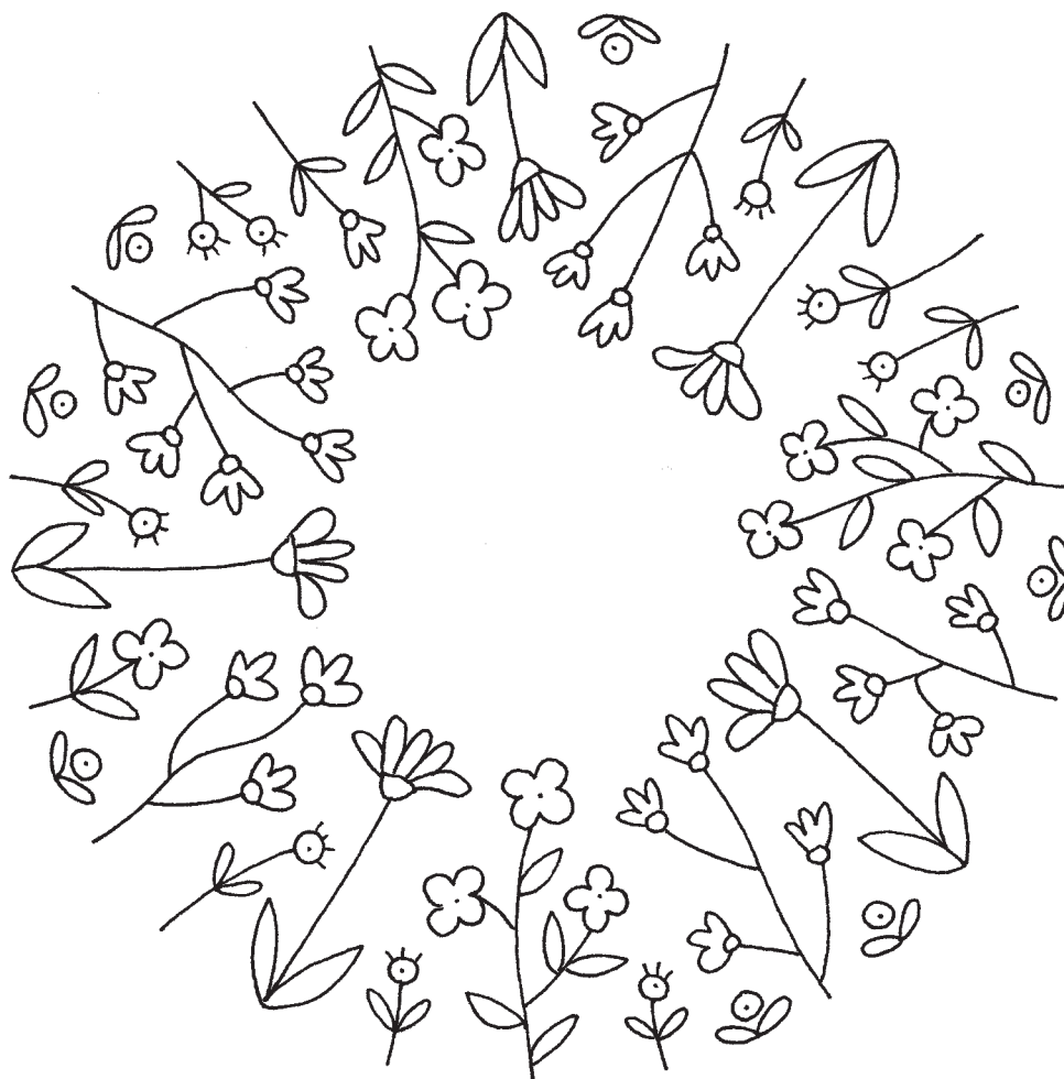
“OWL & HARE HOLLOW” Floral Ring stitchery design

Print your chosen design/templates from the Homespun website. Before printing, check the Print dialog box – it is important that in the field next to the words “Page Scaling” you have selected “None” to ensure your design/templates print out at 100%.